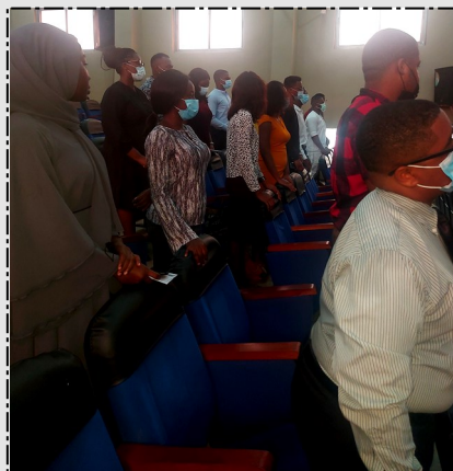
Prayer time for the newly qualified doctors