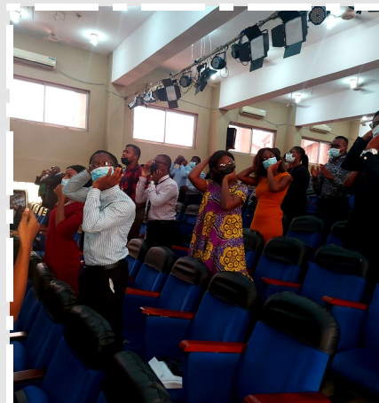
Exercises promotes mental wellness , participants observing stretch break at the workshop